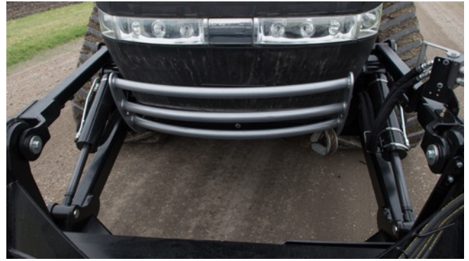
High Lift Height and Ground Clearance