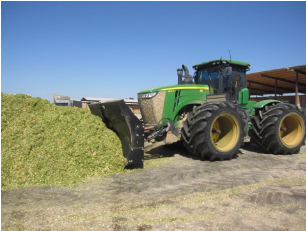
Large Carrying Capacity