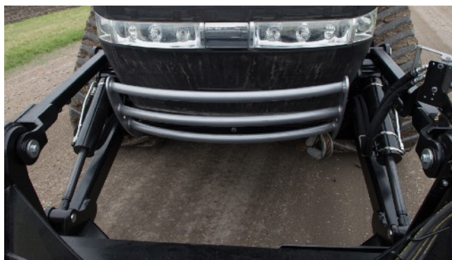
Relocated Tilt Cylinder Reduces Silage Build-up