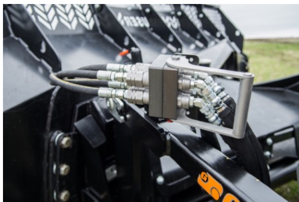
Grease Bank for Easier Servicing