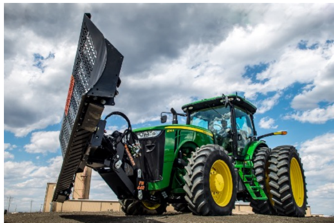
AG240i for OEM Front Hitches