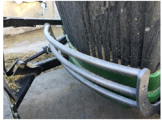
Relocated Tilt Cylinder Reduces Silage Build-up