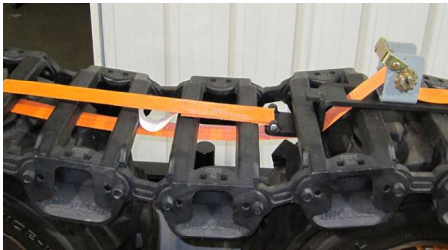
Optional Track Installation Tool